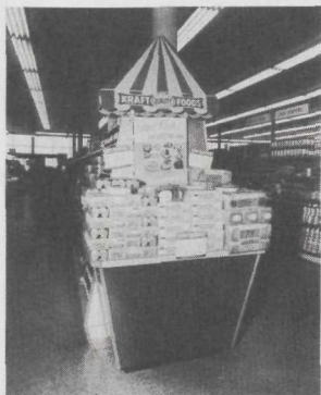
Kraft end-aisle display is one of several merchandising pieces prepared for in-store promotion

The full-color booklet containing more than 90 recipes and food ideas will go to approximately one million Canadian households. An additional million were sent to dealers for free distribution. Chains and key independent stores have exclusive rights to the promotion of some of the recipes, and Kraft has sent promotion aids to all major stores.