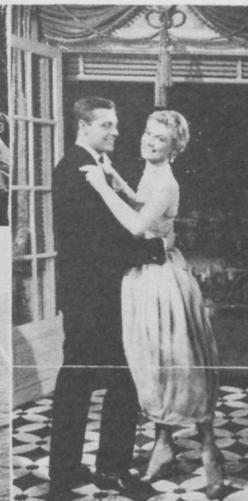
A formal party at the home of Alexander Dumas is an occasion to remember.

The dramatic commercials take viewers to interesting affairs such as a garden party on the grounds of the Alexander Dumas estate, a yachting party at Deauville and to the famous horse jumping show at St. Cloud. Each of the 11 scripts tells a story involving the use of one of the Pond's products sold abroad.