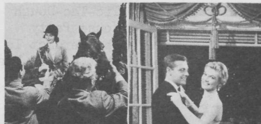
The exciting jumping contest at St. Cloud (right) made another interesting setting for a commercial.

What ensued through their efforts was a series of 60-second commercial stories entitled, "Glamour in Paris Presented by Pond's," which makes use of beautiful natural settings such as the Pont Archevêché over the River Seine with Notre Dame in the background.