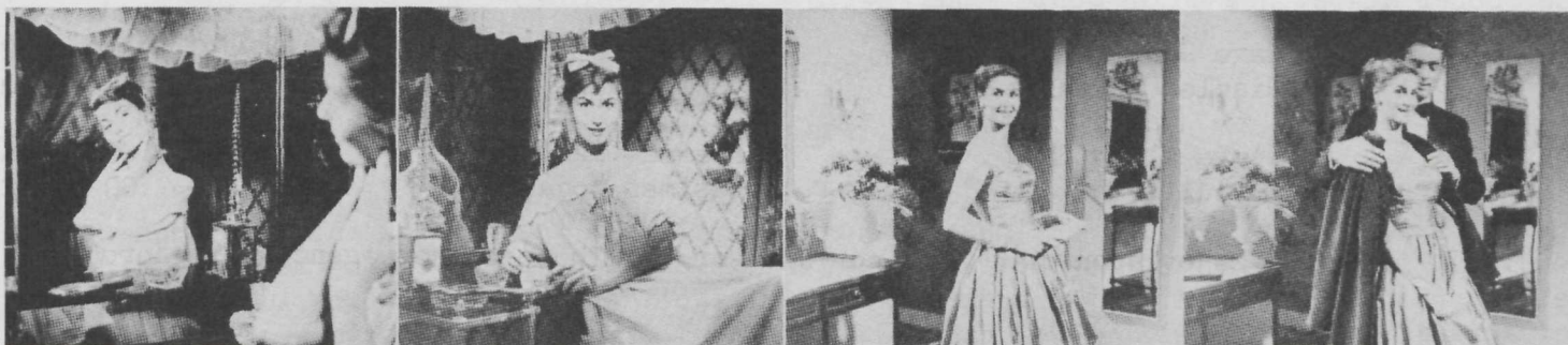
Highlights from one of 11 film commercials produced in Paris

The "Glamour in Paris" theme also will be featured in Pond's print media advertising campaign in many countries during 1958.