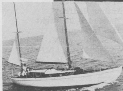
One story called for a yachting sequence at Deauville.