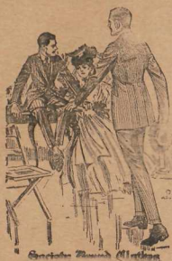
Copyrighted Illustration of Mr. [Name]