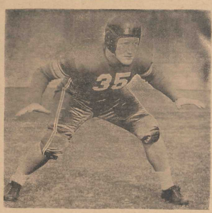
Can you name this former Duke gridiron star? He was one of the Iron Dukes a few years ago. He is at present in the Navy. Answer on page 4.