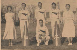
This picture of the two coed cheerleaders who made a brief one-time appearance in 1935 may be duplicated Friday night, when two coeds will help lead cheers in the Page pep rally.