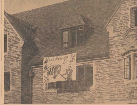
Representing a mild example of an anticipated war-time decorative scheme in celebration of Homecoming, October 6, the above picture depicts in part 1945's war-time decorative scheme in celebration of Homecoming.