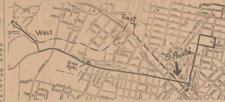
Additional service between West Campus and Five Points via University Apartments will begin Sunday, Nov. 5, to supplement the present East Campus route and provide service for new residential developments on Duke University Road. On the above map the new route is marked by a solid line; a broken line marks the present route.

Cost — two bucks plus tax; and, being romantic, we'll throw in a super gift wrap job free.