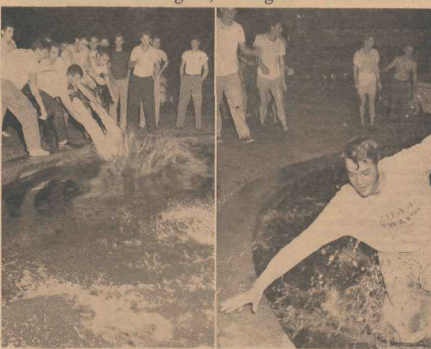
Freshmen pledges revenge themselves on future fraternity brothers as the bandstand becomes a scene of nightly violence. A series of such dunkings is currently striking the campus; freshmen run rampant and pledge-captains await their turns.