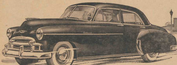
The Styline De Luxe 4-Door Sedan

Here's the best and most beautiful car at lowest cost