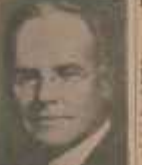
From Russell section caption.