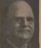
Home Affairs section caption.