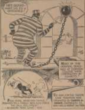
For the man who borrows, the chain is heavy. It is heavy because it is heavy.